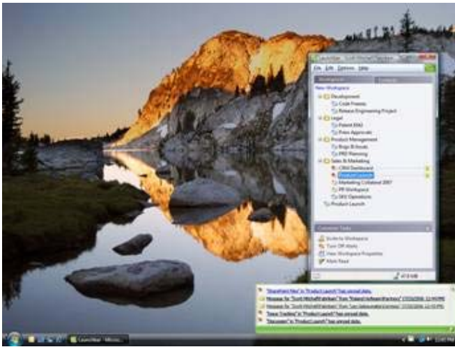
Customized alerts keep you updated and on track.